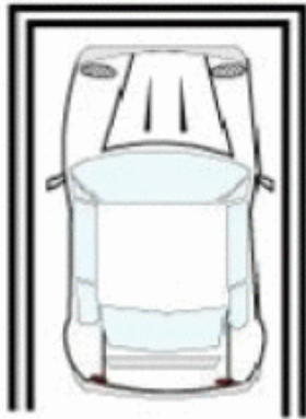
SINGLE SECURE CAR SPACE