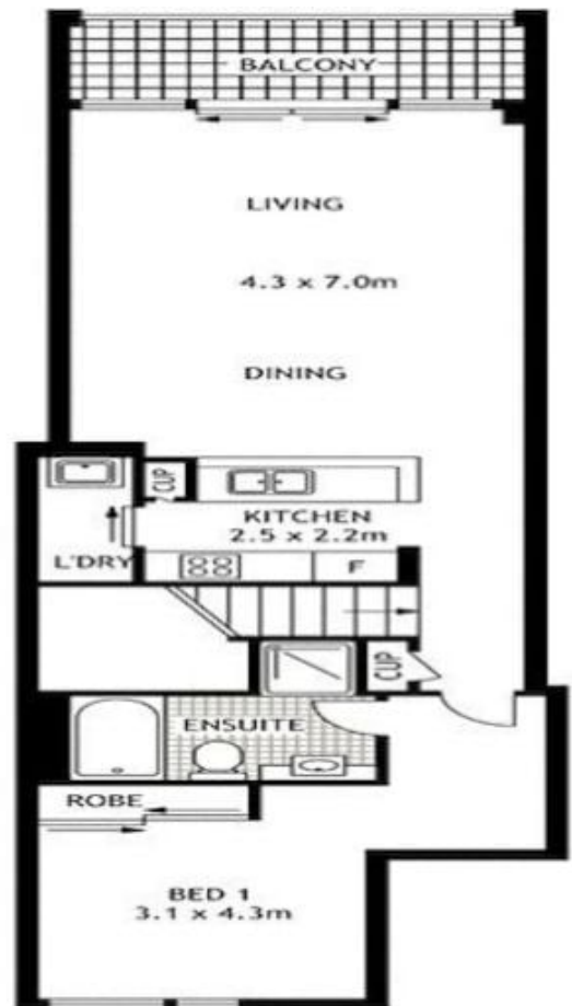
TWENTY FIFTH FLOOR