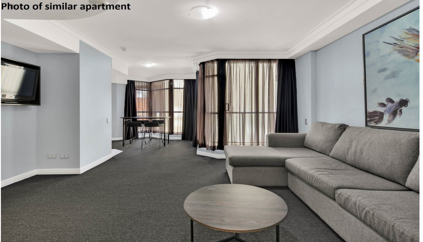
Photo of similar apartment