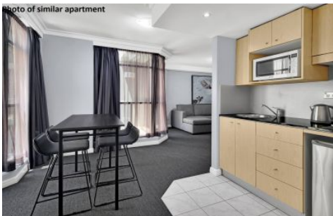
Photo of similar apartment