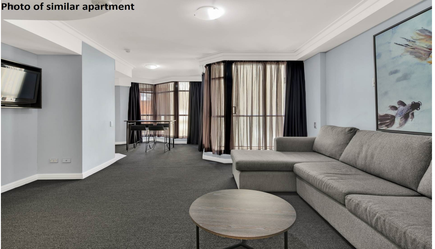
Photo of similar apartment